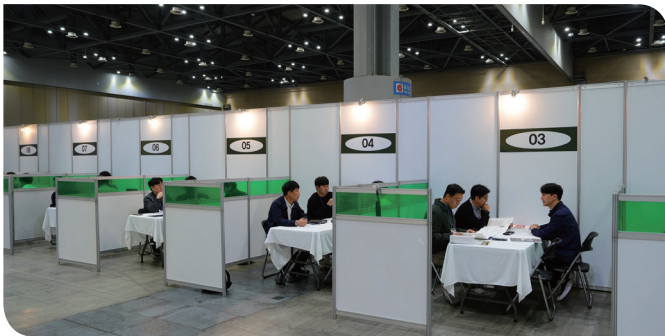
Domestic Business Meetings