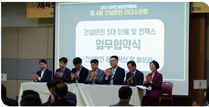
Construction Safety Leaders' Forum