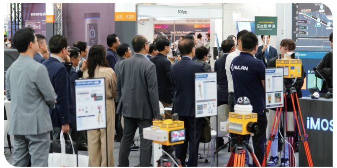
Docent Tours for Buyers